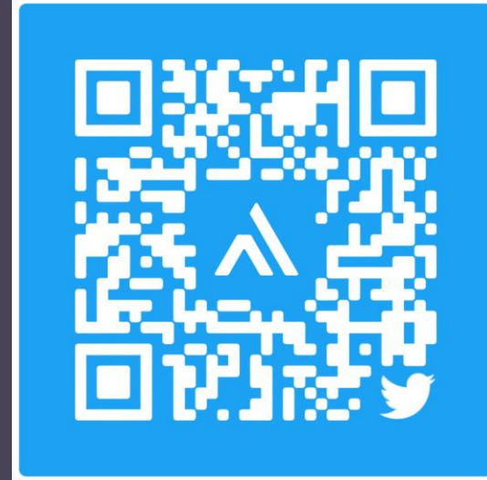
CyCraft | Twitter