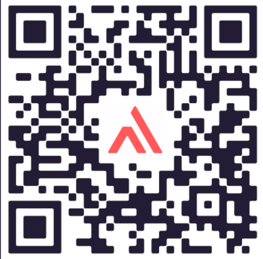
CyCraft | Website