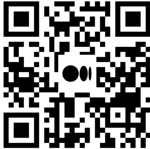
CyCraft | Medium